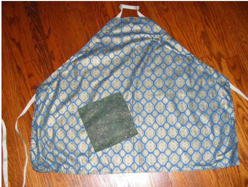
Glitter Blue Geo