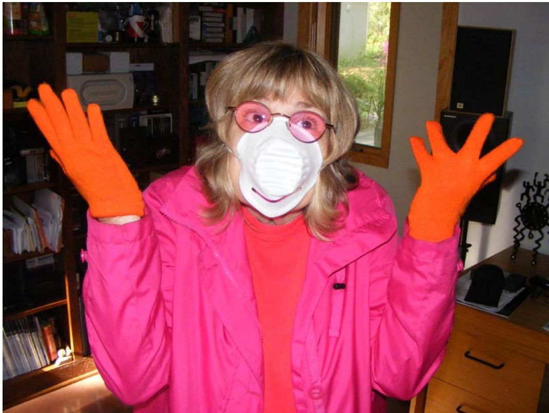
My COVID Moment – April 2020: What to do? What to do? I know, CRAFT!!!