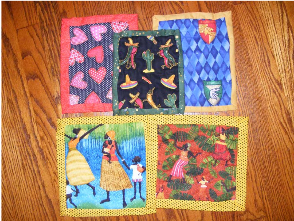
Hearts, Harry Potter, Dancing Chili Peppers, Africa