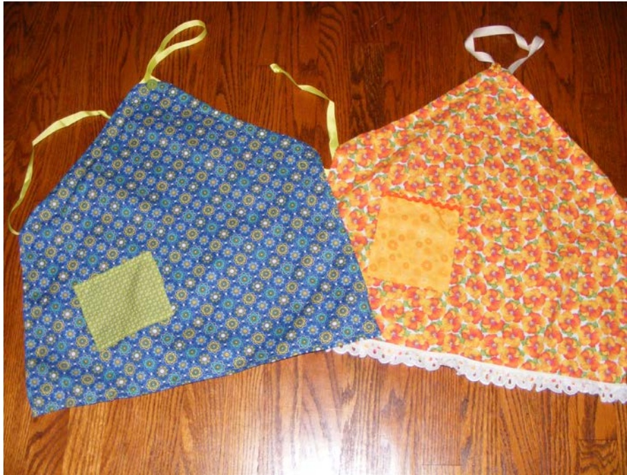
Little Ones Aprons

Christmas, Halloween, Florals. Ask to see individual photos. (Adult and some child sizes)